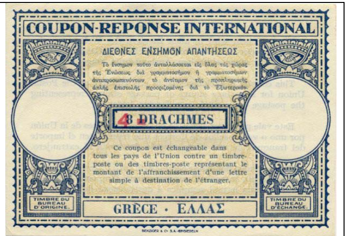
Type Lo09-2A Provisional handwritten