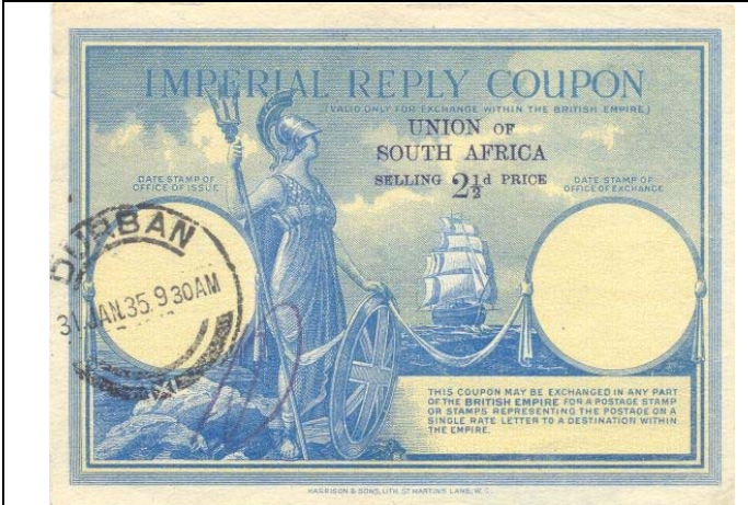
02-1 - Union of South Africa - Harrison. Multiple, small wmk GvR, "last line "THE EMPIRE"