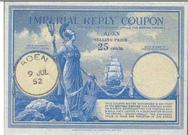
08-2 Aden – "Selling price 25 cents." on two lines