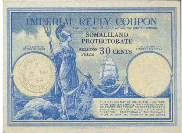
08-2 – Somaliland "Selling price 30 Cents" on two lines