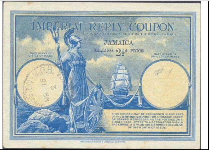
01-1 - Jamaica