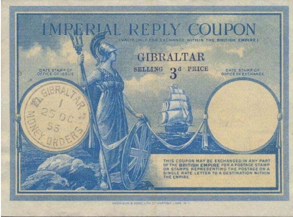
04 - Type 3 hand stamped "Exceptionally....."