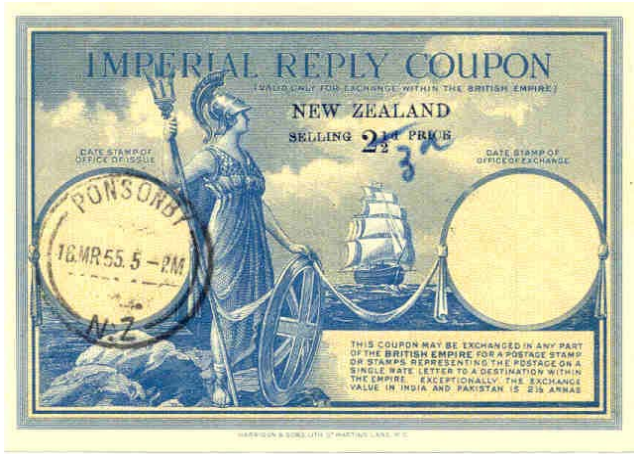
08-1 –New Zealand - Manuscript uprated 3d on 2 1/2d