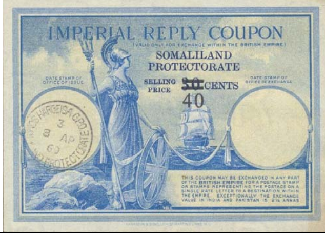
08-2 – Somaliland Protectorate 1960 Printed provisional 40 on 30 CENTS