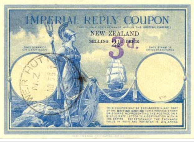
08-1 - rubber cancellation uprated 3d on 2 1/2d