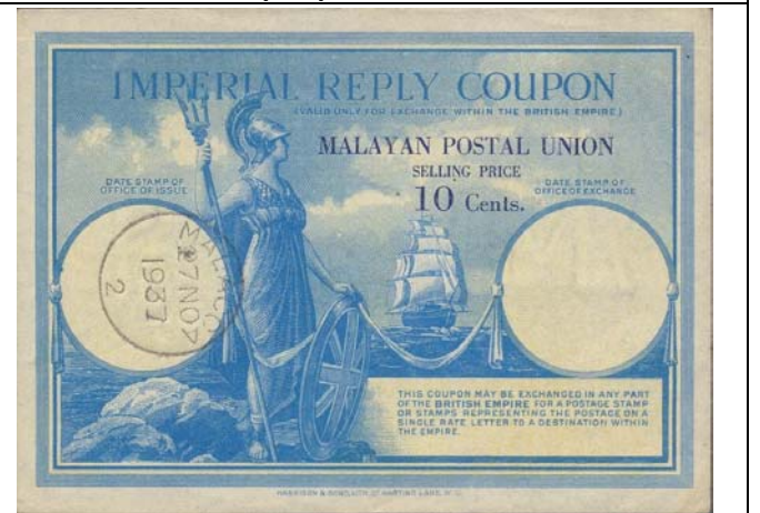
03-2 Malayan PU - "Selling price / 10 Cents." on two lines