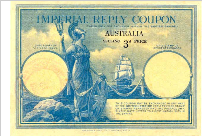
03-1 - Australia - As type 2, but large wmk GvR.