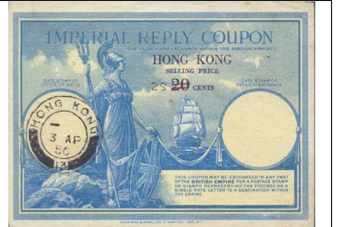
02-2 - Hong Kong - "Selling price / 20 cents" in two lines. Hand stamped provisional 25c on 20c