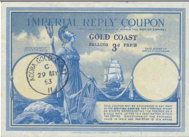
08-1-Gold Coast-Last line "...N INDIA AND PAKISTAN IS.."