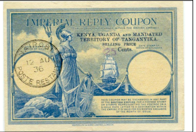
01-2 - Kenya, Uganda, Tanganyika - Without selling price, rubberstamped 25. "Selling price / Cents" on two lines